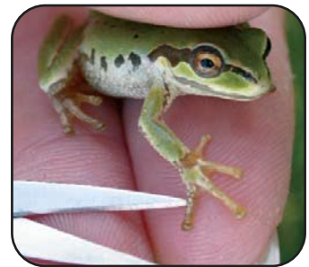
Functional fin and toe clipping are commonly used in studies of fish, amphibians, and reptiles.